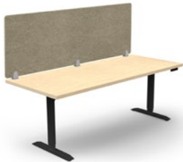
Mounts to surface