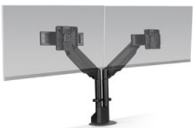
Dual arm features slides for maximum adjustability