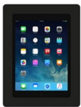
Landscape or portrait orientation

62956-AIR-HRC-BLK: No home button and camera access