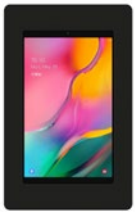
Landscape or portrait orientation