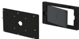
Fast and easy installation