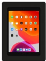
Landscape or portrait orientation

62956-IPAD7G-HBC-BLK: No home button and no camera access