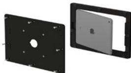
Fast and easy installation