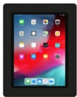
Landscape or portrait orientation