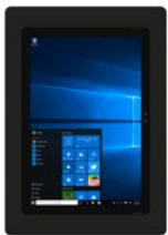
Landscape or portrait orientation