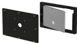
Fast and easy installation