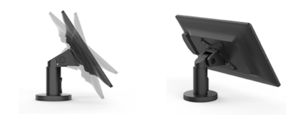
Easily adjust the display for optimal viewing