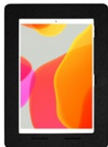
Landscape or portrait orientation