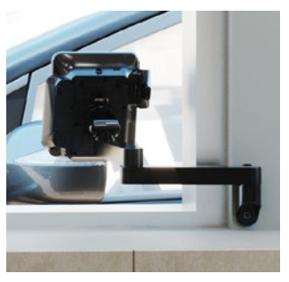
Increase flexibility by combining the wall mount with our optional extension arms

The PTS-WM-P200-P400 supports the Verifone P200 or P400 payment device.