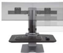
Independent monitor height adjustment