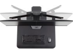
Focal depth adjustment