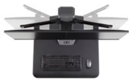
Focal depth adjustment