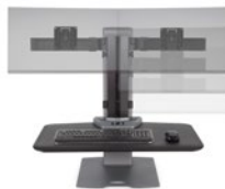
Independent monitor height adjustment